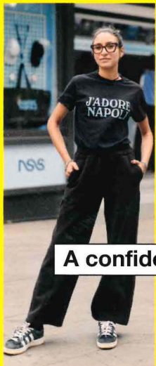
A confident stance